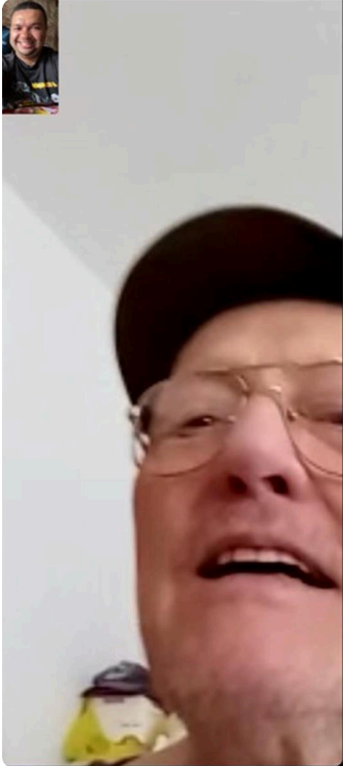
A Video Call With My StepFather??